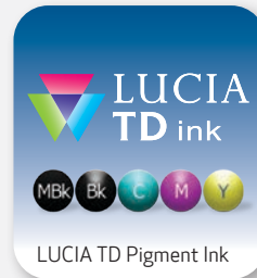
LUCIA TD Pigment Ink