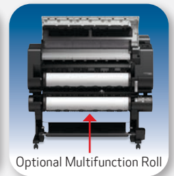
Optional Multifunction Roll