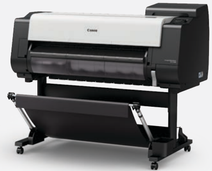
imagePROGRAF TX-3100 Printer with Multipositional Catch Basket