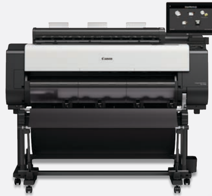
imagePROGRAF TX-4100 MFP Z36 Printer with TX Stacker